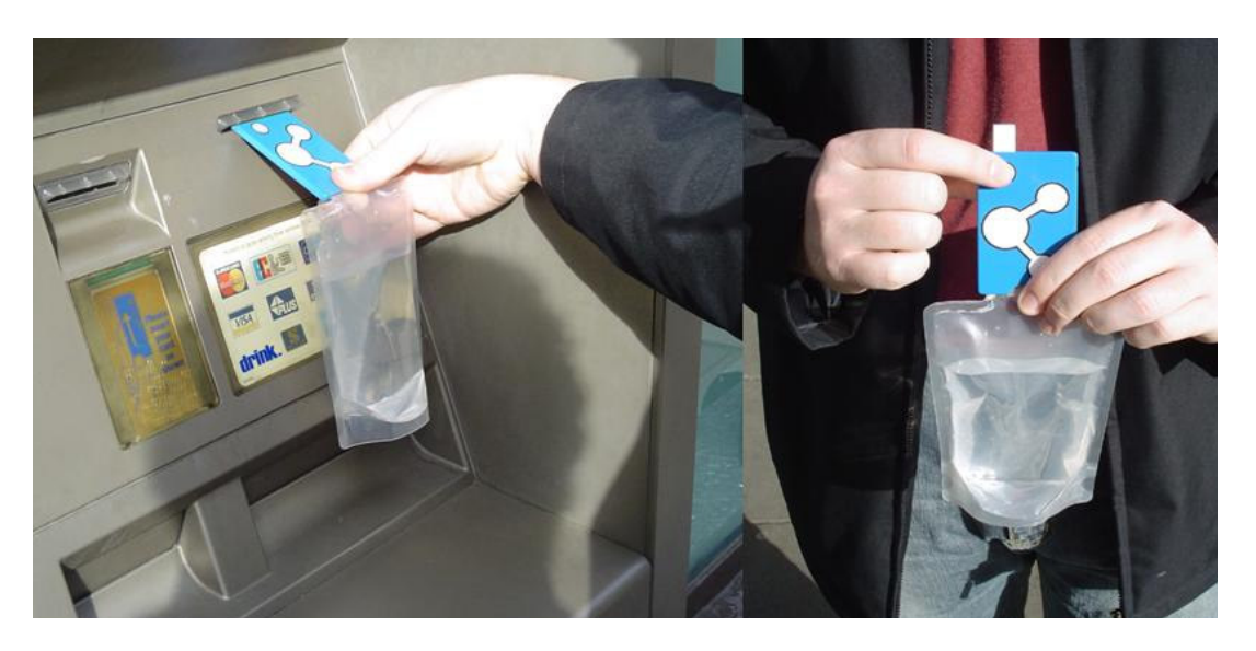
Figure 7 "Water on the Go!"

The dual branding of both bank and water company would be branded across both. The water receptacle folds up to the size of a credit card so that it can be easily carried on the person. So again, this can be seen as a very successful interdisciplinary design project.