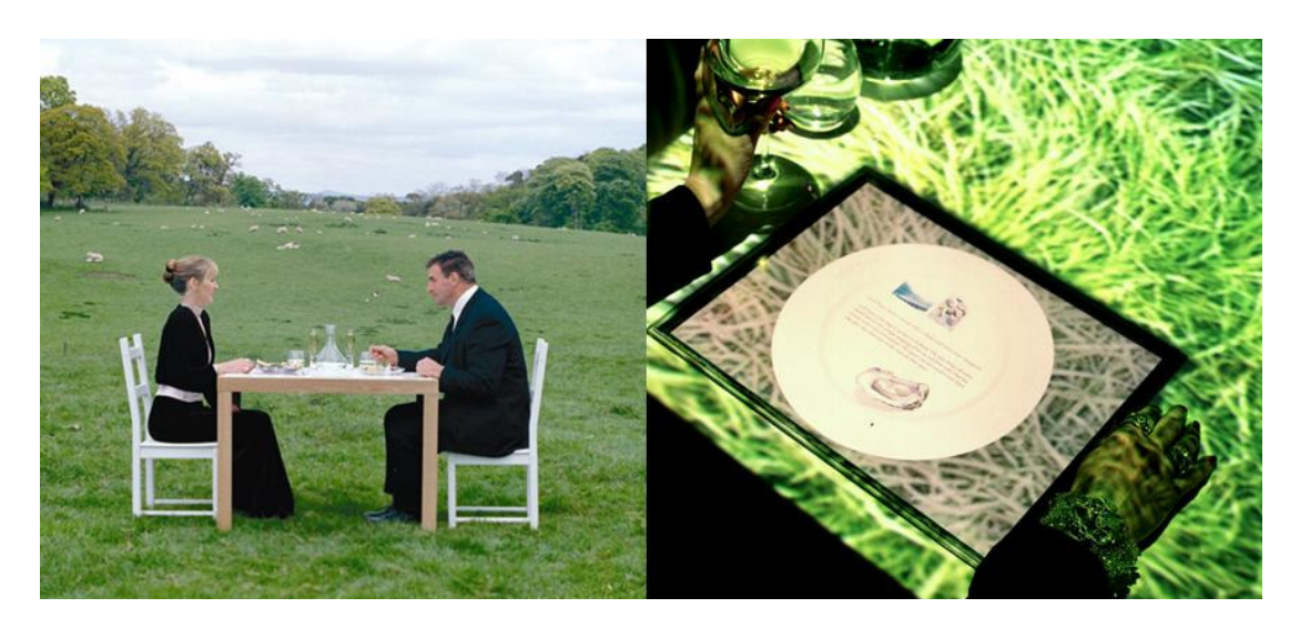
Figure 6 Interactive Dining Table

The concept proposed here is an interactive table that lets diners know what food is available when dining, where it has been farmed, the reputation and provenance of the farmer and also the cost of the dish (Figure 6). Like the previous two projects, one can see fairly obviously that this project transcends many boundaries in modern design practice.