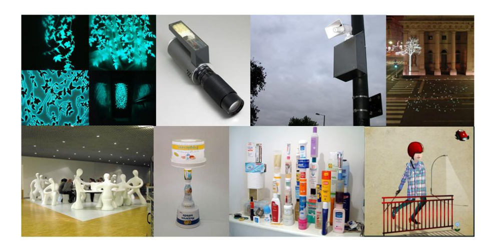
Figure 3 Interdisciplinary design examples (clockwise from top left: loop.ph, Troika, Moritz Waldemeyer, Simon Heijdens, Greyworld, Daniel Eatock, Helmut Smits, Atelier van Lieshout)

Figure 2 (above) and Figure 3 (below) highlight the emerging interdisciplinary nature of contemporary design. This emerging hybridised design work is illustrated best by the following eight perhaps somewhat lesser known international designers and design teams.