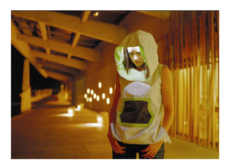
Figure 4 Seasonally Affected Disorder (SAD) Fashion Garment

One of the most interesting aspects of this project is that it was carried out in collaboration with a wide range of individuals including fashion buyers, pattern cutters, technologists and manufacturers. The project transcended many historical or conventional design boundaries including product, fashion, and graphic design and also moved into fields such as electronics, marketing, dress-making and branding. As we speak, considerable interest has been shown in this project from a couple of notable garment manufacturers in Milan.