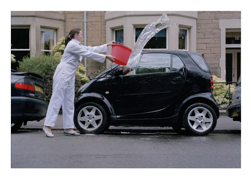
Figure 5 "Good Deeds" Design Service

Similarly, this project breaks a number of conventional design boundaries and disciplines including graphics, multimedia, product, and branding but also includes some aspects of business practice and entrepreneurship. One of the results from this project was a published book which was very successful.